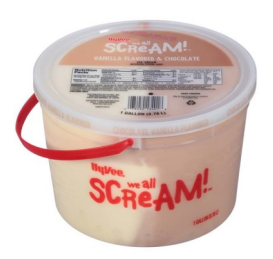
Fort Branch First is collecting gallon size empty ice cream buckets with lids for an upcoming soup fundraiser.

OCTOBER 2<sup>ND</sup> with special offering